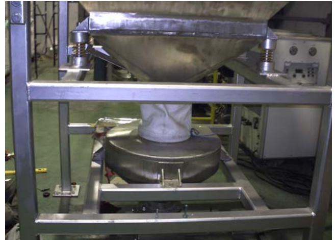
Big Bag Unloading station