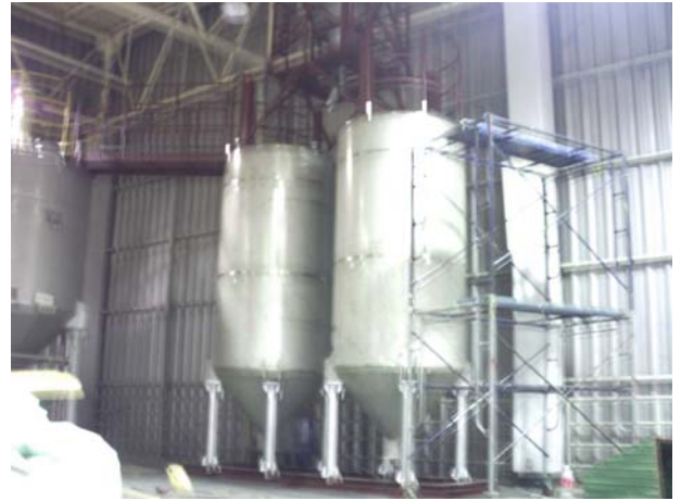
Storage Tank size,6.0 m 3 ,SUS 304