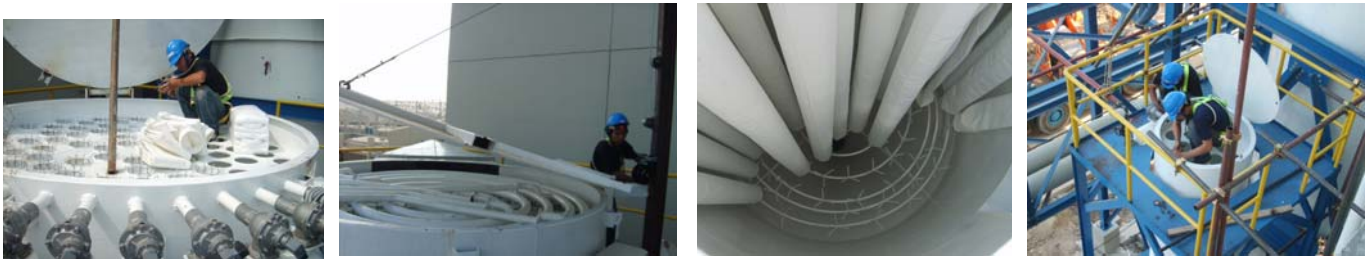
Self Cleaning (Jet Pulse) Bag filter