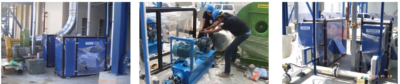
Roots & Centrifugal blower