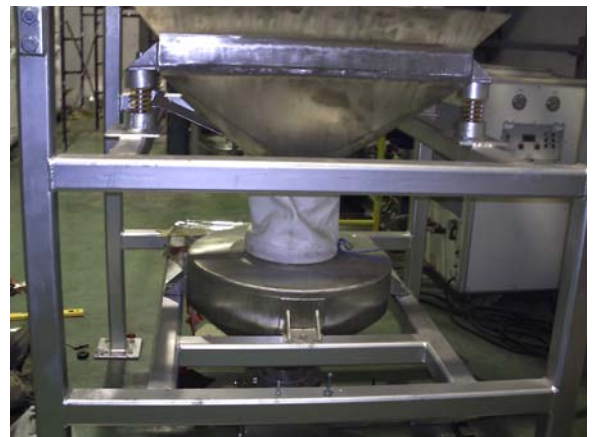
Big Bag Unloading station