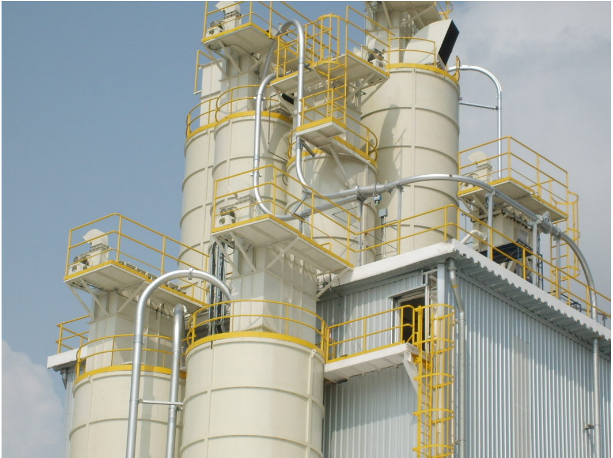
Bentonite Clay Powder Loading System