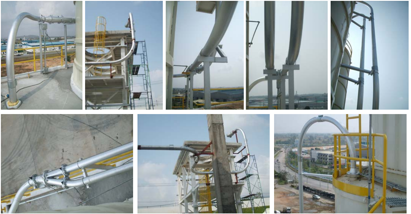
6.0" and 8.0" Conveying Piping System