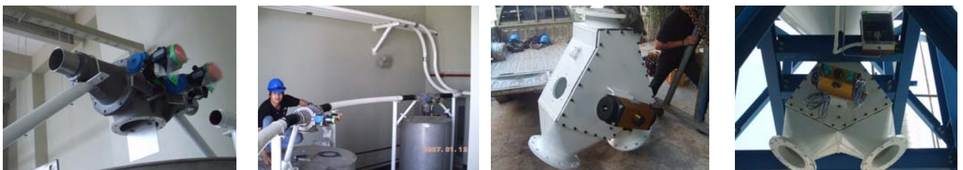
Fill Vent (Scale) valve