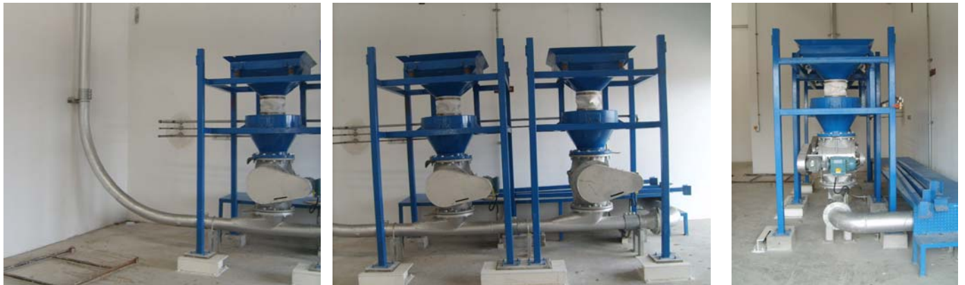
Big Bag Unloading station