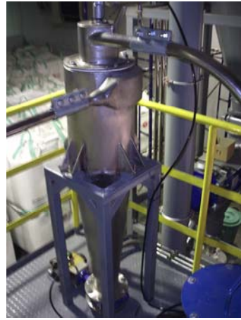
Self Cleaning (Jet Pulse) Cyclone Receiver