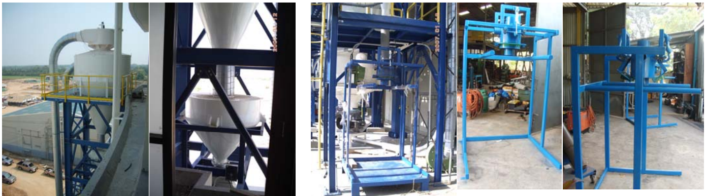
Cyclone & Surge hopper