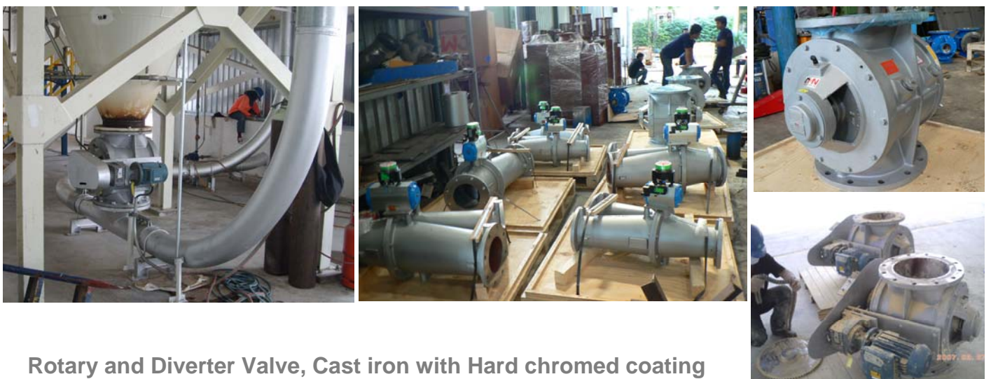
Rotary and Diverter Valve, Cast iron with Hard chromed coating